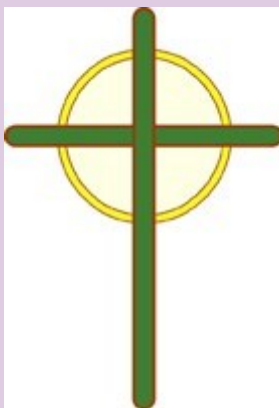
St. Charles Presbyterian Church Founded 1818

Answers to Brain Teasers: 1. Heroine 2. Your breath 3. A quarter and a nickel 4. A wedding ring 5. Exit C. If a lion hasn't eaten in 3 years, it has definitely starved to death.